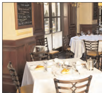
Ideal for any commercial environment.